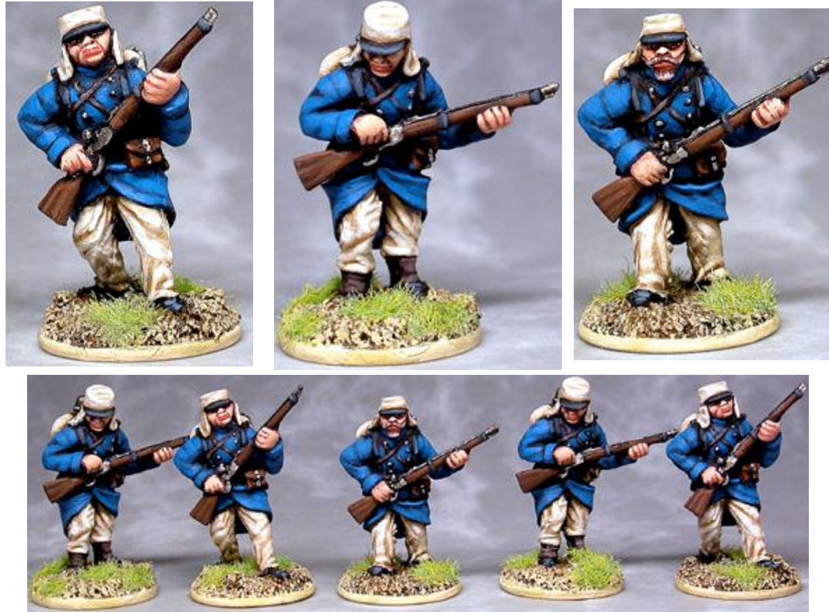
French Foreign Legion by Castaway Arts - Painted and Photographed by Andrew Lum .

Base Trim: Buttercrunch (Folkart), Bleached Bone (GW)